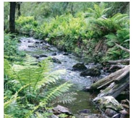
Lerderderg River, Moorabool Shire.

Melbourne Water has over 100 water quality monitoring sites across the Port Phillip and Westernport region. Five new long-term water quality sampling sites have been added within the Moorabool Shire. These sites are used to measure compliance with various standards, identify changes and trends over time, identify pollution sources and continue to inform the community about the health of local waterways.